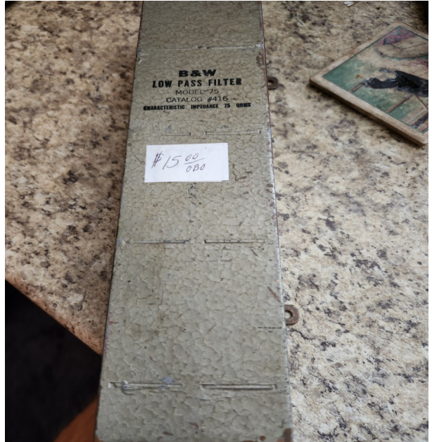
B&W Model 75 Low Pass Filter Asking Price: $15.00 OBO

Solid state electronically regulated Fold-back current limiting protects power supply from excessive current and continuous shorted output Crowbar over voltage protection on all models except RS-3L, RS-4L and RS-5L Maintain regulation and low ripple at low line input voltage Heavy duty heat sink Three conductor power cord