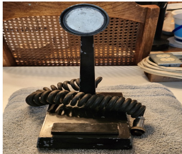
Base Station Microphone Asking Price: $5.00 OBO

L B (Nick) Nickerson – K9NQW k9nqw1979@gmail.com