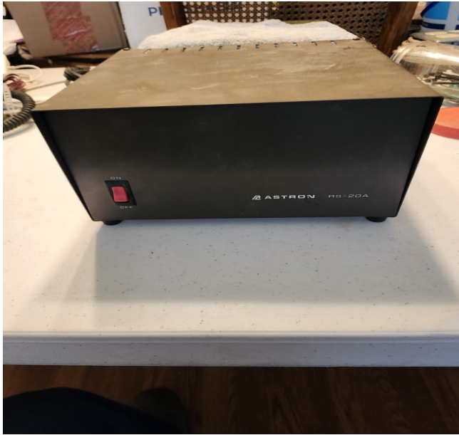
Astrom RS-20A Power Supply Asking Price: SOLD

Solid State electronically regulated. Feature fold-back current limiting to protect the power supply from excessive current or shorted output. Chassis mounted fuse. Less than 5 mv ripple peak to peak (full load and low line).